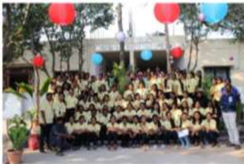
SRI SAMVIDHAN – MBA FEST