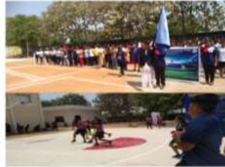
PRATIYOGITA – SPORTS FEST