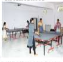
Table Tennis Court