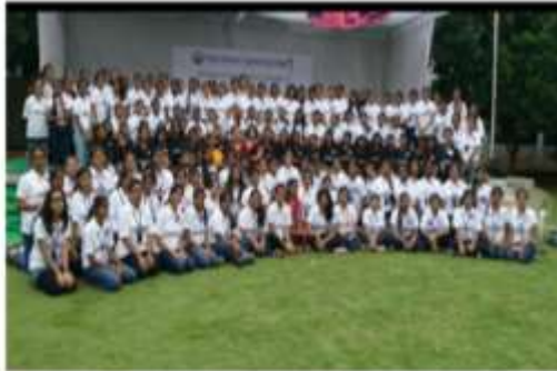
VIDHYOUTH – TECHNICAL FEST