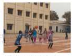
Throw Ball Court