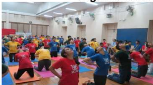
Yoga and Meditation